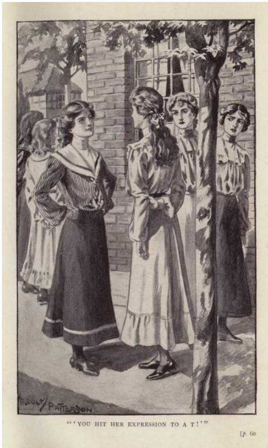
“YOU HIT HER EXPRESSION TO A T!”