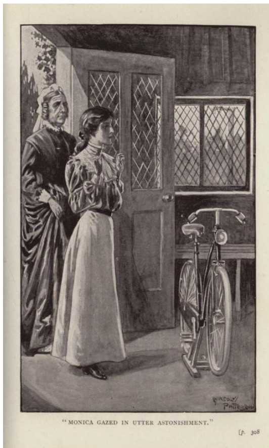
"MONICA GAZED IN UTTER ASTONISHMENT."

She fitted a key in the lock, and opened the door, and Monica gazed in utter astonishment at what she saw; for, resting on its own stand in the middle of the quaint, octagonal summer-house, was a beautiful, perfectly new bicycle!